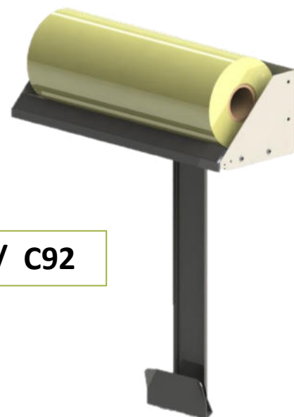
C62 / C92