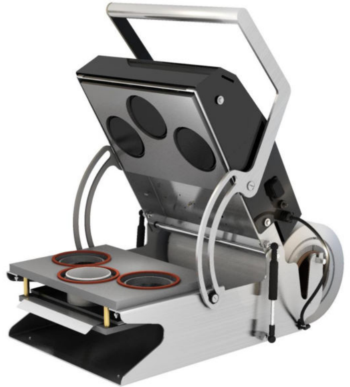
Round SC 300