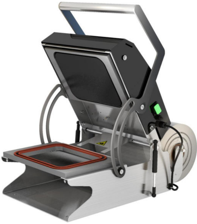
Menu SC 300