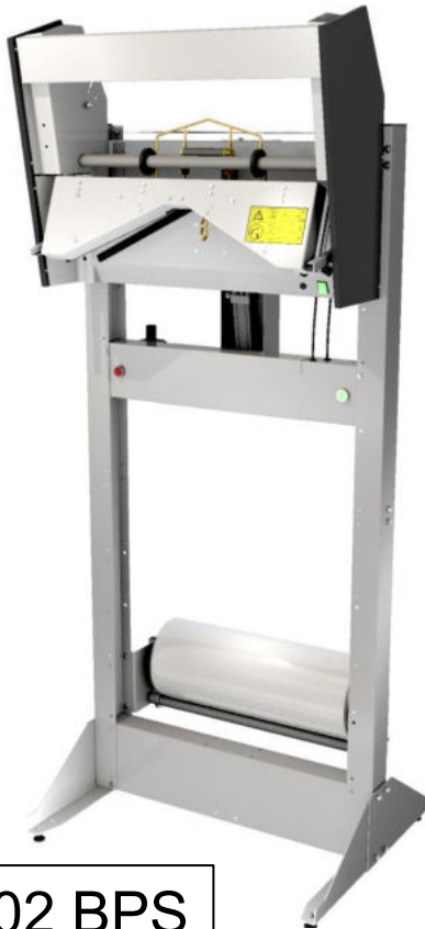
H 602 BPS